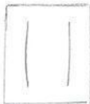
Buckle - Cut from gold paper. Cut slits within buckle

Print message on inside of card making sure it is centered. You can print two cards from one sheet of paper.