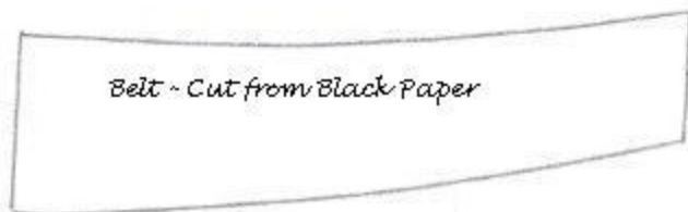
Belt - Cut from Black Paper